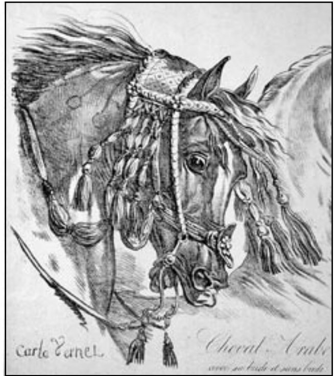
Above left is the Al Khamsa stallion Mister Kheys (Khemahr x Khebaba) and above right is a 19th century lithograph of an Arabian horse head by Carle Vernet. While it is the artist's freedom to stylize, one can see that the fine dry skin, prominent veins and facial expression of Mister Kheys represent qualities similar to that which must have inspired Carle Vernet more than a century and a half ago. The horse of the past is still a part of the present in Al Khamsa bloodlines. Mister Kheys is Combined Source breeding.