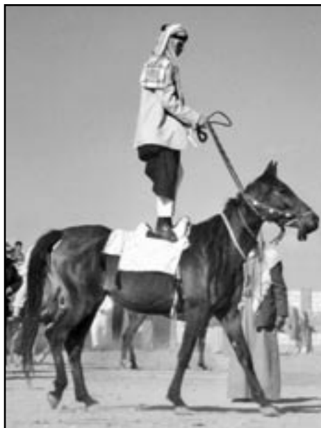
Above left is a picture from Prince Mohammed Ali's book in 1936, and above right is a picture I took 60 years later when the Shammar tribe presented their horses.

These are but a few comparisons of the past to the present. It is reassuring to know that there are Bedouin today that have struggled to maintain what has been in their family for a very long time. For a visual person like me, it was a magnificent gift to be able to see this. But it is also inspiring to know that these traditional kinds of horses are not lost, but remain a part of the fabric of the kinds of horses we are trying to preserve and wish to enjoy. So long as we continue to be aware of the culture and foundation that created the ancestors of Al Khamsa horses of today, we will succeed in preserving this kind of horse for the future. The best benchmark for our perceptions and decisions about how we breed is to "think like the Bedouin" and be understanding and aware of all the bloodlines available to us. To truly value and identify more objectively the common elements among breeding groups is our greatest assurance for continuity of this "noble horse of the desert" entrusted to us.