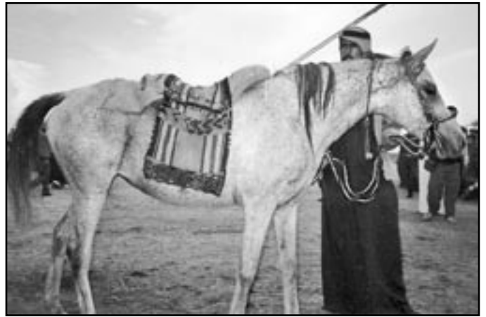
In 1906 Homer Davenport drew a horse in the desert with a traditional Bedouin saddle. Ninety years later while visiting the Tai Bedouin, a Shuwaymah mare was presented to us with her traditional Bedouin saddle, still constructed in the same fashion. She looked like the kind of mare found in Davenport or Blue Star herds. It was a wonderful continuity experience.