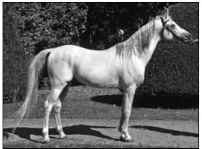
When this stallion (left) owned by the head Shaikh of the Tai tribe was presented to us, I could not help but reminisce of similar overall proportions and character to the EAO stallion Akhtal [Amrulla (EAO) x Hagir (EAO)], pictured at right.