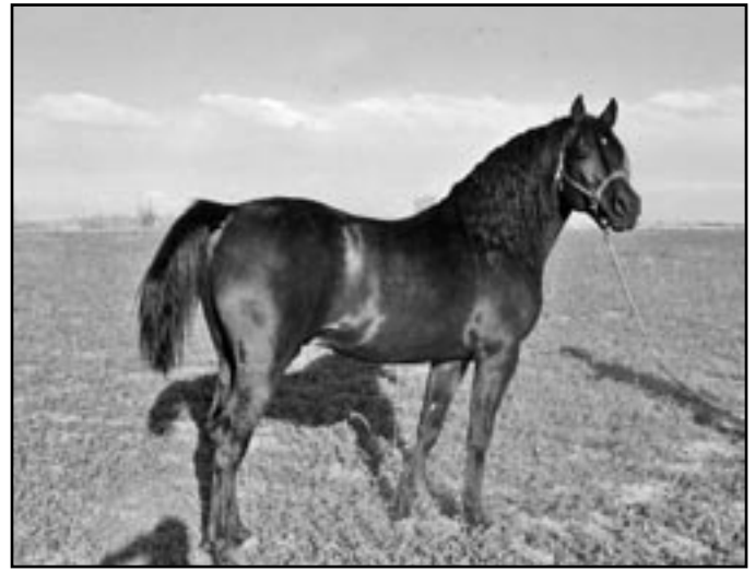
About 30 years ago my grandmother gave me an old print of a painting of the Wellesley Arabian, another 19th century work of art that shows the powerful, curvy form found in many Arabians centuries ago. The continuity of this look carries forward in numerous Al Khamsa bloodlines. San Luis Marc Antony (Mista-Bin x San Luis Bint Dorzah) is a good example.