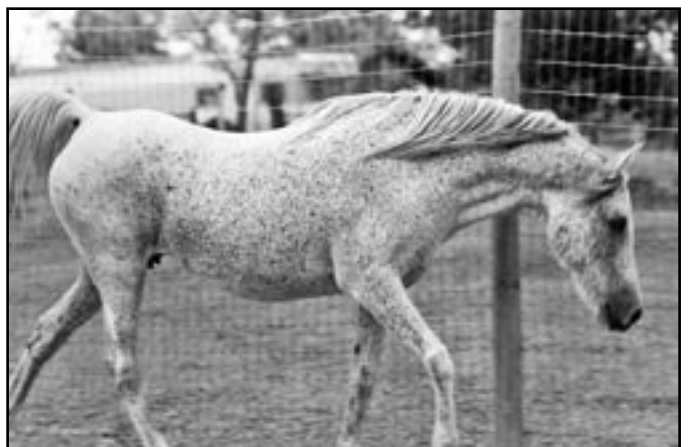
When the Shammar tribe presented their mares for us in 1996 I saw similarities with horses I already knew. The Hamdaniyah Ibn Ghorab mare (at left) intrigued me with her similarities to the mare at right, Belle Echo (Bel Gordas x Faarecho). It is enlightening to discover that features of tribal horses of the Shammar can also be found in the horses of Al Khamsa breeding.