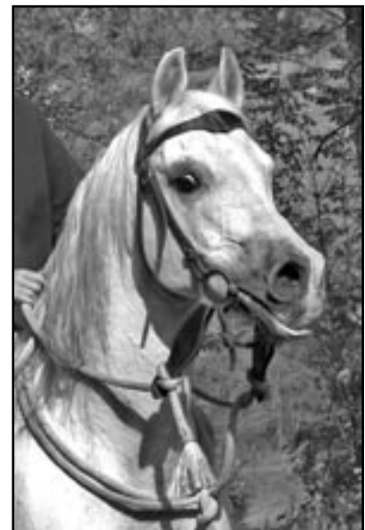
Anyone who has seen the Davenport stallion Javera Thadrian (Thane x HB Diandra) in person would agree that he also demonstrates that "special look" that would have inspired Vernet and others in the nineteenth century. His extremely fine skin, prominent veins and noble expression and demeanor are unforgettable.

Some feel that the "horse of the desert" from the days of Bedouin life gone by is no more. But is it? The more one reads the descriptions from old books and studies old art, old engravings, and photos from the past, one will get a sense of the traditional horse of the desert. Then just look around and it will be still be found in Egyptian, Davenport, Blue Star, Combined Source and similar breeding groups. Our bloodlines are still quite fluid depending on the choices we make. Perhaps it is not how we breed but how we see. On the next few pages I offer some picture comparisons with commentary using old art, photos or pictures of Bedouin-bred horses from my 1996 travels in the Middle East.