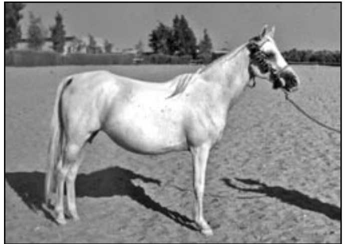
Seeing this Tai Bedouin mare in 1996, (left) I was struck by things that reminded me of numerous photos of the EAO mare Zaafarana [Balance (RAS) x Samira (RAS)] in general form and expression.